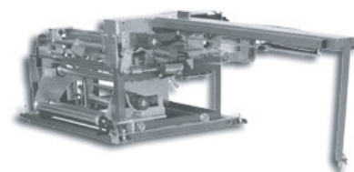
Packaging Machine for plastic bags

■ The color of the products are not exactly same as the color in this catalog.